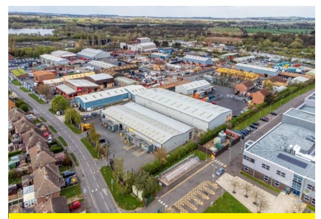
Hallcroft Industrial Estate near Retford; North Notts BID has used Disc to extend its crime reduction activities to cover industrial areas

"We use Disc not just to report thefts and antisocial behaviour" says Jeanne. "If someone has come out of prison, for example, we can use Disc to warn people that they're in a certain town. But of course offenders move between towns, so we can use Disc to alert people across our area.